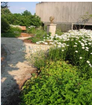
EMILY DICKINSON GARDEN AT THE BETTENDORF PUBLIC LIBRARY

The public library has been historically a vital instrument of democracy and opportunity in the United States.... Our history has been greatly shaped by people who read their way to opportunity and achievements in public libraries. — Arthur Meier SCHLESINGER (1888-1965)