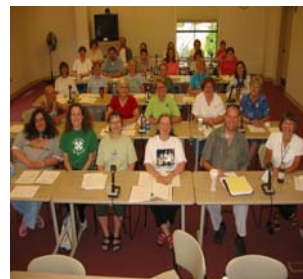
SOME OF THE LIBRARY STAFF JUNE, 2005