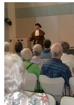
MONTHLY SENIOR PROGRAM

Sample New Activities : Program attendees will find a new variety of programs offered by community residents with expertise in a certain subject.